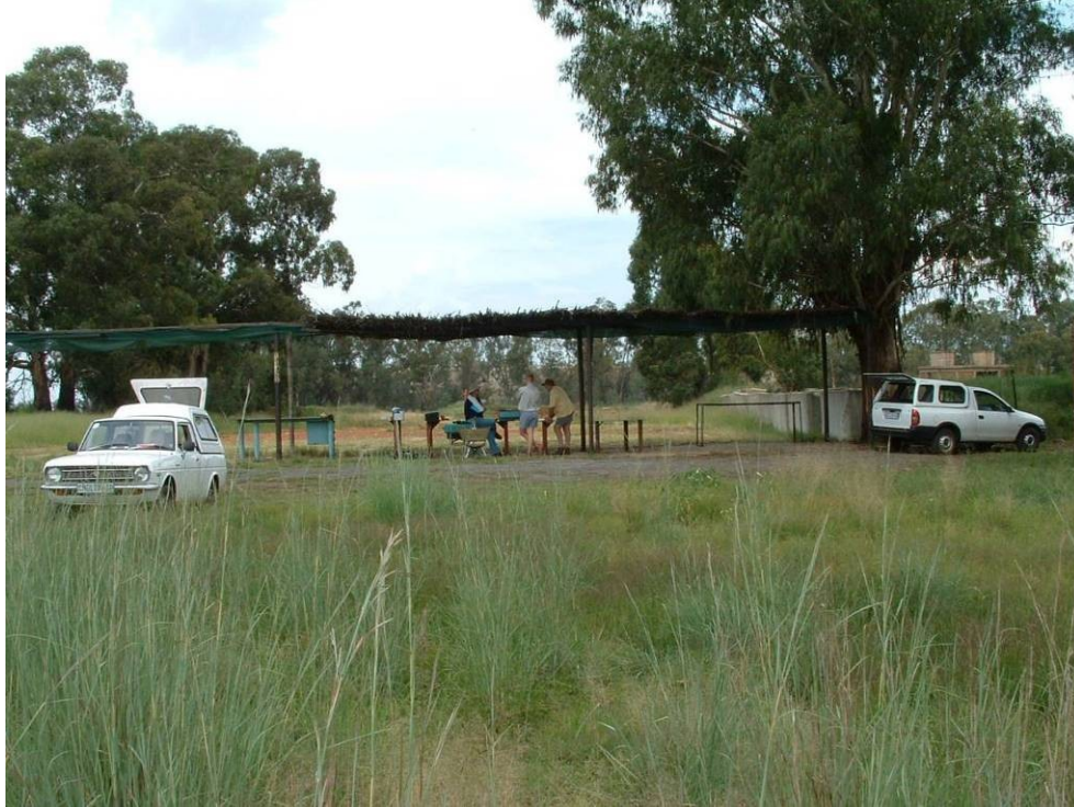
Blesbok shooting range - Springs